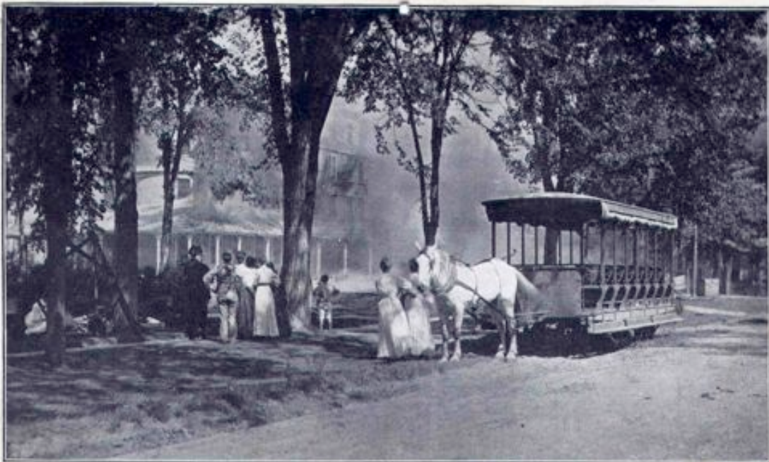
"The Oxford" where the Fryeburg fire of Aug. 31st started.

As I was putting this issue together I kept coming across something else interesting – to me anyway. Here is a horsecar stopped in front of the burning Oxford Hotel in Fryeburg, ME on August 31, 1906. This is a postcard image sold in 1907 and it's not clear if the horsecar stopped on a regular trip or brought spectators to the fire.