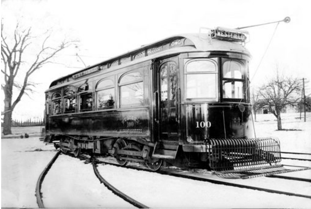
Western Massachusetts Street Railway No. 100 Signed For Westfield

And a very pretty car that operated there: