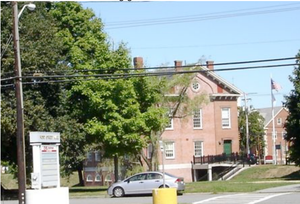
Essex County Superior Courthouse (Newburyport) in August 2010

Below is the courthouse today taken more or less from the far end of the string of cars in the above image. It is located on the Mall, pronounced māl (the British way) – sounds like the man’s name Hal as opposed to the American pronunciation that is similar to fall. It used to be the militia training ground.