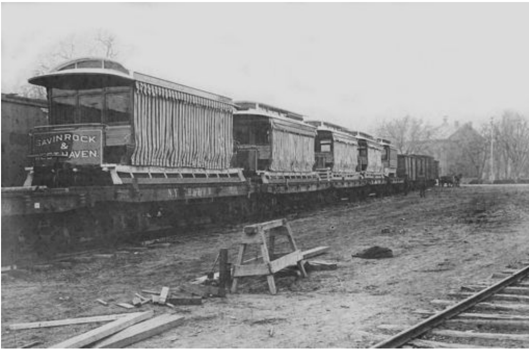
Boston & Maine Freight Yard – Newburyport, MA

Below is the courthouse today taken more or less from the far end of the string of cars in the above image. It is located on the Mall, pronounced māl (the British way) – sounds like the man’s name Hal as opposed to the American pronunciation that is similar to fall. It used to be the militia training ground.