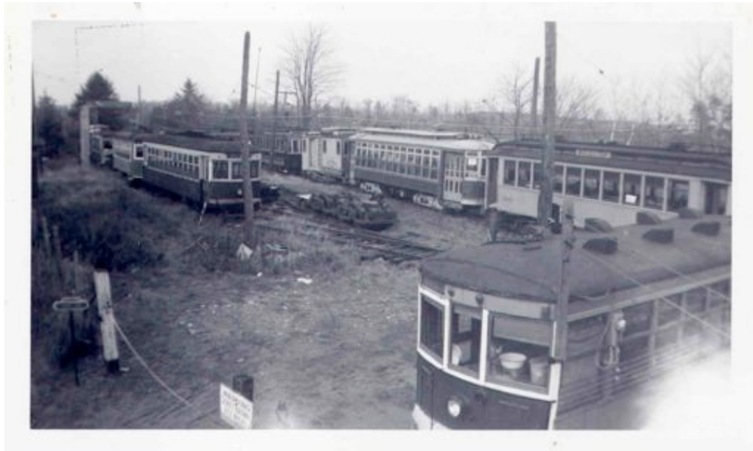
Seashore Trolley Museum – November 23, 1951

According to the photo's notation the following was taken on November 23, 1951. This provides us with a slightly aerial view of the front of the property. Things are still pretty much out in the open and probably pretty cool. Again it is amazing how little there was to work with in those earlier days.